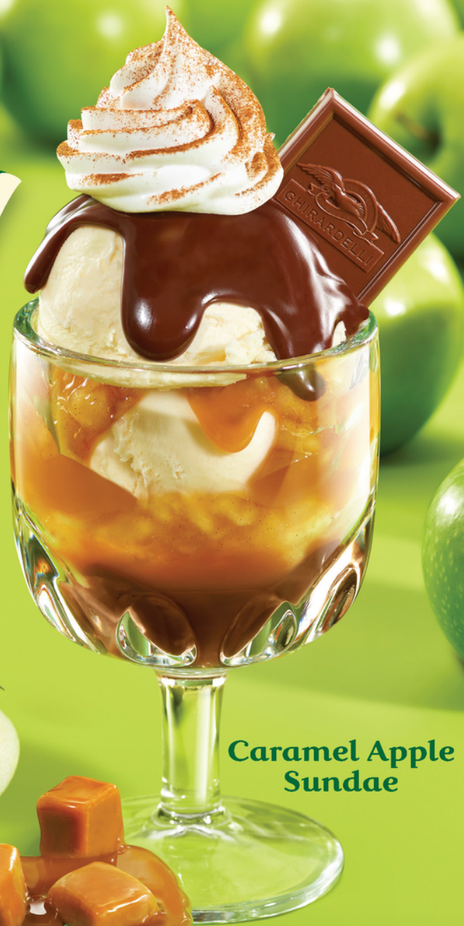
Caramel Apple Sundae

GHIRARDELLI'S CHOCOLATE SHOP & SODA FOUNTAIN