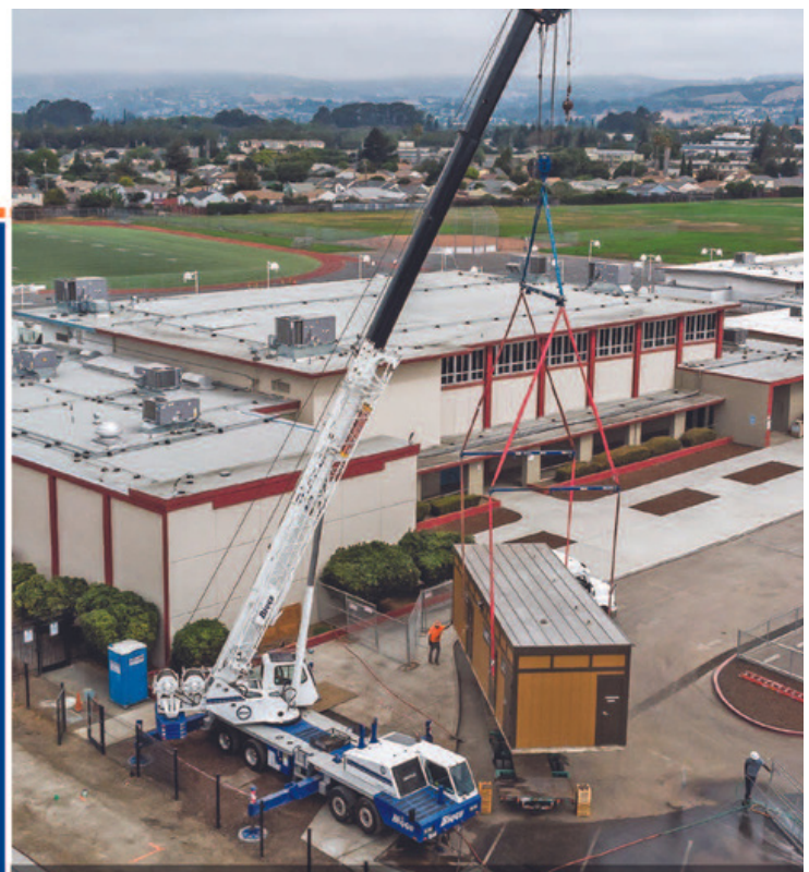
Modular Building Install - John Muir Middle School

BIGGE IS PROUD TO SUPPORT THE SAN LEANDRO EDUCATION FOUNDATION.